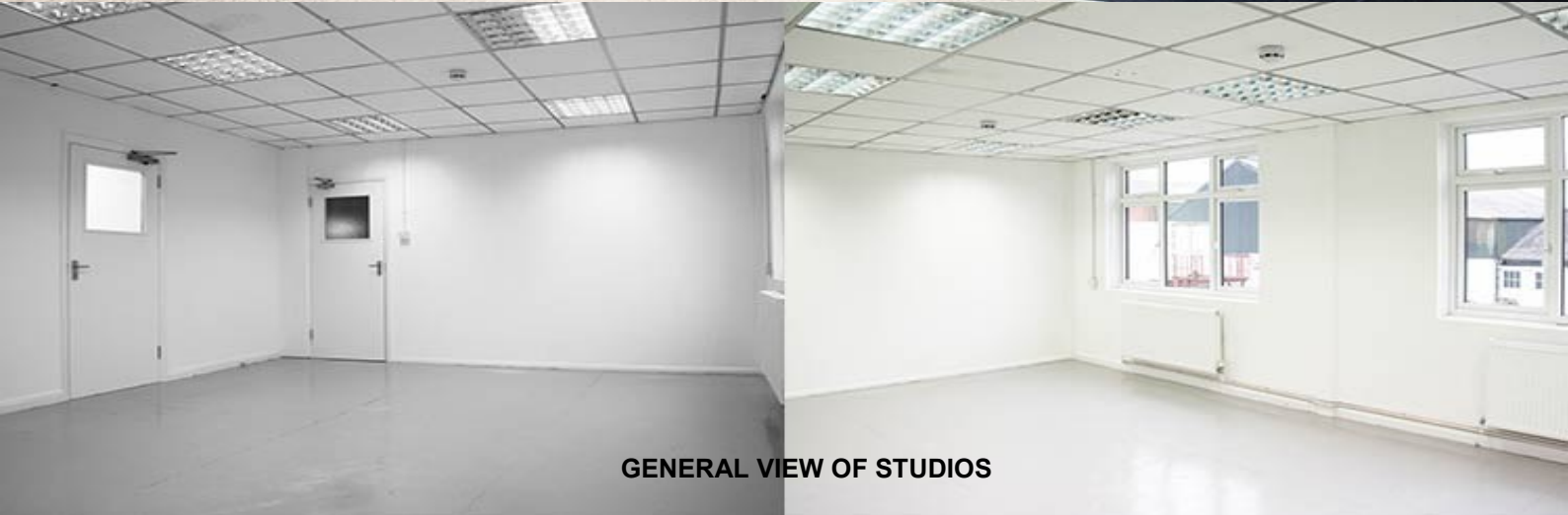
GENERAL VIEW OF STUDIOS

Sneller Commercial Bridge House 74 Broad Street Teddington TW11 8QT